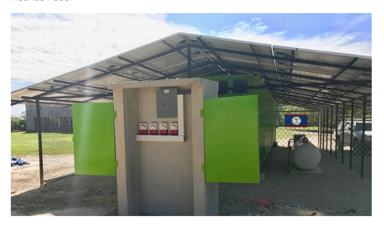
The first houses are now ready to be connected. And it's as clear as it can be: The villagers of La Gracia are ready, too!

This power substation is now as good as finished and the prepaid meters for the houses were mounted inside.